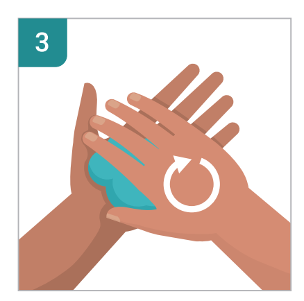
RUB HANDS PALM TO PALM