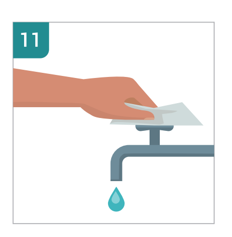
USE TOWEL TO TURN OFF FAUCET