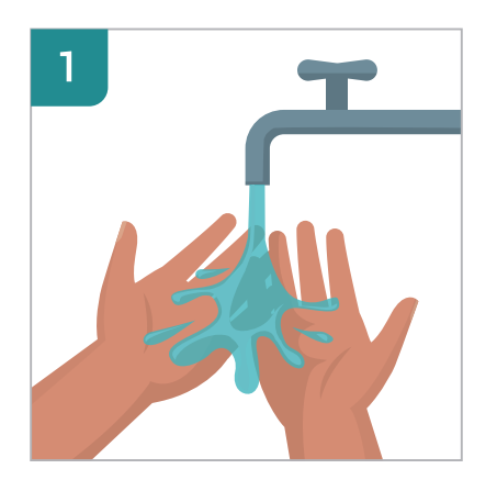
WET HANDS WITH WATER

DURATION OF THE ENTIRE PROCEDURE: 40 - 60 Seconds