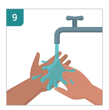
RINSE HANDS WITH WATER