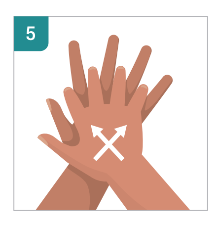
PALM TO PALM WITH FINGERS INTERLACED