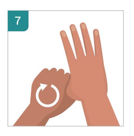
ROTATIONAL RUBBING OF LEF THUMB CLASPED IN RIGHT PALM AND VICE VERSA