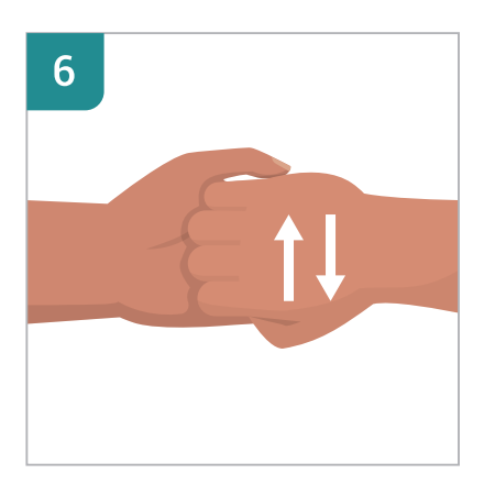
BACKS OF FINGERS TO OPPOSINGS PALMS WITH FINGERS INTERLOCKED