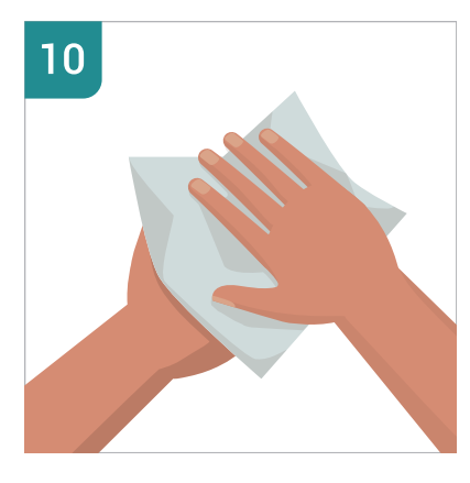
DRY HANDS THOROUGHLY WITH A SINGLE USE TOWEL