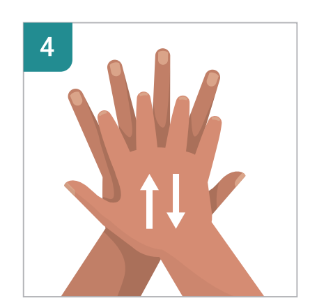
RIGHT PALM OVER LEFT DORSUM WITH INTERLACED FINGERS AND VICE VERSA