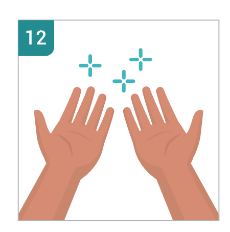
YOUR HANDS ARE NOW SAFE