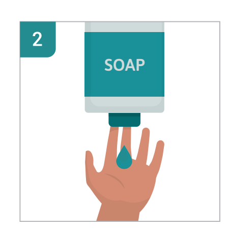
APPLY ENOUGH SOAP TO COVER ALL HAND SURFACES